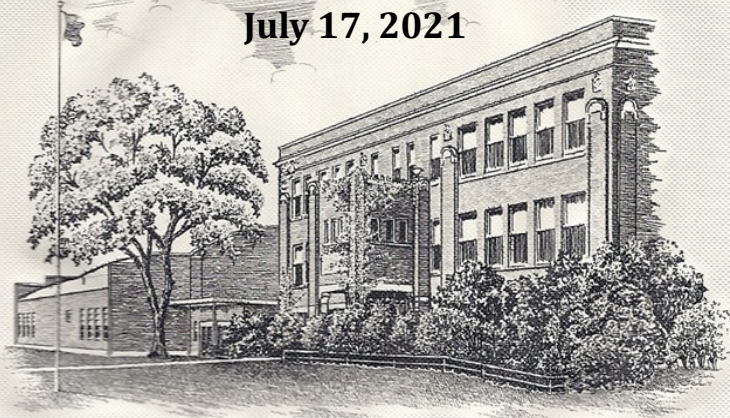
Rembrandt Consolidated School Rembrandt, Iowa

Sioux Rapids Bulletin-Press (May 20, 1971)